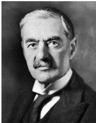
Neville Chamberlain Prime Minister of Britain 1937 to 1940. Tried to give Czechoslovakia to Hitler to make him stop...