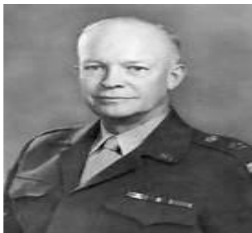
Dwight Eisenhower “ Supreme Commander ” of Allied Forces in Europe. Called for “D-Day” invasion in France in June 1944.