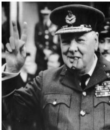
Winston Churchill Prime Minister of Britain from 1940 to 1945. Instrumental in withstanding Germany’s bombings of London...