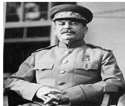
Joseph Stalin leader of Russia during WWII. Signed a “secret pact” with Hitler in 1938 to not attack each other. Hitler will attack Russia in June 1941