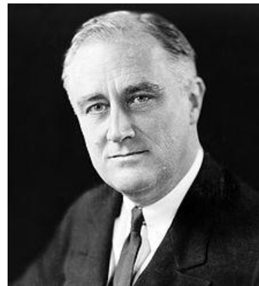
FDR President of US from 1933 to 1945. Urges Congress to join WW II after bombing of Pearl Harbor in Dec. 1941